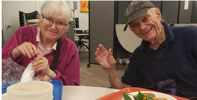
Above: Sharing meals, sharing moments.