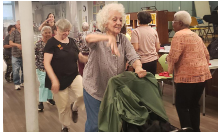
Left: Bringing the groove back—Soul Train style!